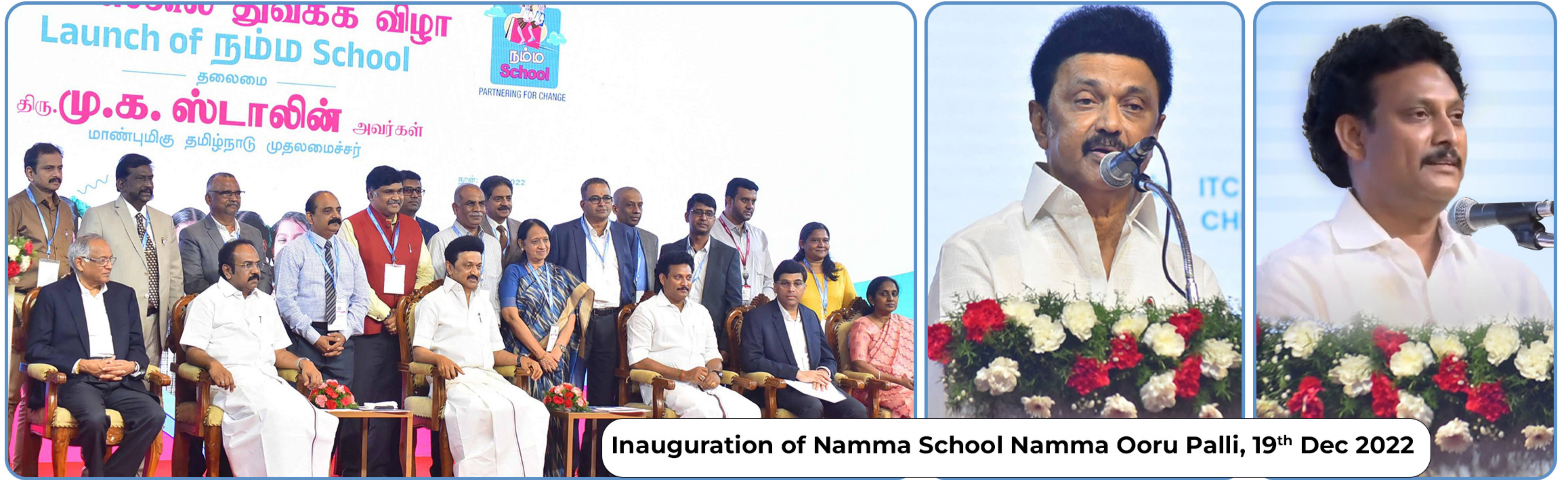
Inauguration of Namma School Namma Ooru Palli, 19 th Dec 2022

Namma School Namma Ooru Palli (NSNOP) is an initiative established by the Government of Tamil Nadu to foster community engagement and CSR partnerships for Government Schools in the State. This visionary initiative was launched by our Hon'ble Chief Minister, Thiru. M. K. Stalin on December 19, 2022.